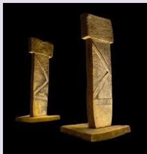
Gobekli Tepe megalith

The Cross is the Tree of Life in the midst of the Garden! The place of power over eternal life and death. The very tree described in Genesis 2! Now look at the stone pillars erected in the Gobekli Tepe settlement: