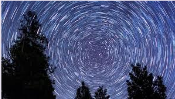
The North Star

Geological ages come and go but the stars in the night sky stay the same. Apes are hunched over. Humans walk upright. It is more natural for us to look up at the night sky and take note of the brilliance of the Cosmos.