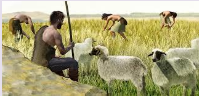
Shepherd of the sheep

to “ have dominion... over every living thing that moves on the Earth ” Gen. 1 v 28. To ‘have dominion’ did not mean be the top predator, it meant keep wild animals at a distance and domesticate tameable animals.