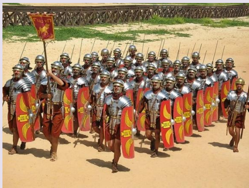
Mighty Roman legions appear in the Holy Land

“Blow the trumpet in Zion, and sound an alarm in my holy mountain: let all the inhabitants of the land tremble: for the Day of the Lord comes, for it is nigh at hand. (v.1); A day of darkness and of gloominess, a day of clouds and of thick darkness, as the morning spread upon the mountains: a great people and a strong; there has never been the like neither shall be any more after it, even to the years of many generations. (v.2); A fire devours before them; and behind them a flame burns: the land is as the garden of Eden before them, and behind them a desolate wilderness; yea, and nothing shall escape them. (v.3); The appearance of them is as the appearance of horses; and as horsemen, so shall they run. (v.4); Like the noise of chariots on the tops of mountains shall they leap, like the noise of a flame of fire that devours the stubble, as a strong people set in battle array. (v.5); Before their face the people shall be much pained: all faces shall gather blackness. (v 6); They shall run like mighty men; they shall climb the wall like men of war; and they shall march in formation, and they do not break ranks. (v 7); Neither shall one thrust another; they shall walk everyone in his own column: and when they lunge between the weapons, they are not cut down. (v8)” (Joel 2)