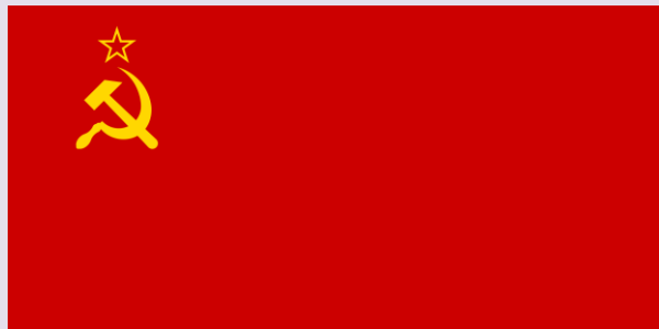
Flag of Soviet Union

“ Send forth your sickle, for the harvest is ripe: come, get you down; for the press is full, the vats overflow; for their wickedness is great. ” (Joel 3 v 13)