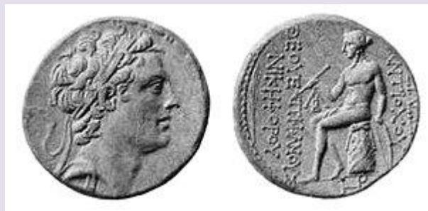
Coin of Antiochus IV Epiphanes: [In Greek] 'Victorious God Manifest King Antiochus'

"Is not the meat cut off before our eyes, yea, joy and gladness from the house of our God? (v.16) The seed is rotten under their clods, the garners are laid desolate, the barns are broken down; for the corn is withered. (v.17) How the beasts groan! The herds of cattle are perplexed, because they have no pasture; yea, the flocks of sheep are made desolate. (v.18) O Lord, to thee will I cry: for the fire has devoured the pastures of the wilderness, and the flame has burned all the trees of the field. (v.19) The beasts of the field cry also to thee: for the rivers of waters are dried up, and the fire has devoured the pastures of the wilderness. (v.20)" (Joel 1)