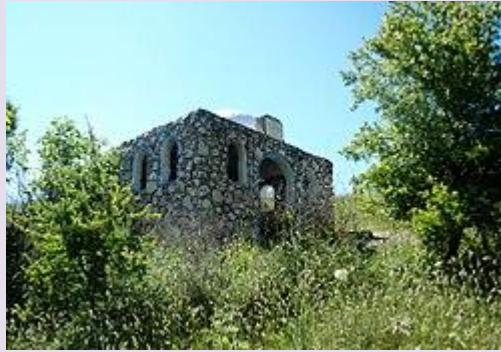
Tomb of Joel in the town of Jish.