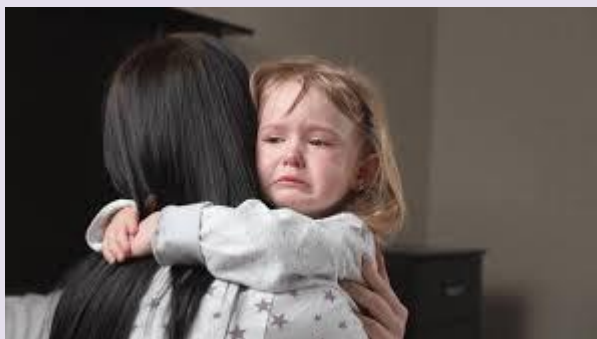
Milk of human kindness is dried up.

I have calmed my soul like a weaned child with its mother. O Israel hope in the LORD from this time forth and forever. Psa. 131v2-3