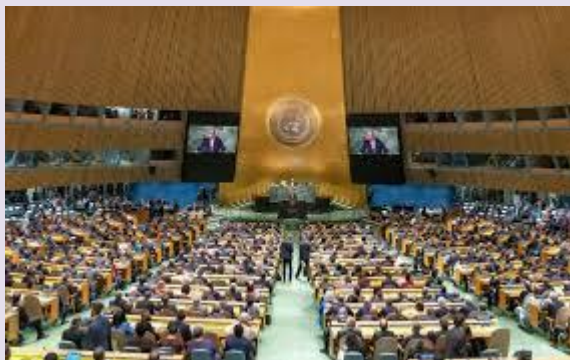
By the Waters of Babylon We Sat Down

After World War I a Mandate under the authority of the League of Nations permitted Jews to return and resettle the Holy Land. After World War II the nation of Israel was born. A new institution, the United Nations, gathered all countries to New York City for diplomacy. World trade brought riches and prosperity. World cities filled with amusements and distractions captivated the minds of men in the West. Christian heritage faded from memory. Christian churches closed due to lack of interest.