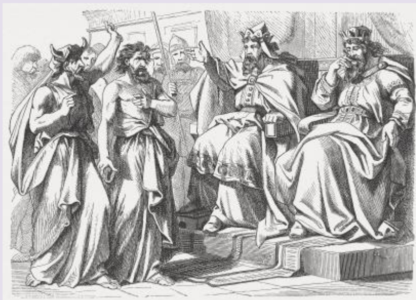
Jehoshaphat and Ahab

“For, behold, in those days, and in that time, when I shall bring back the captives of Judah and Jerusalem, (v.1); I will also gather all nations, and will bring them down into the Valley of Jehoshaphat, and will plead with them there for my people and for my heritage Israel, whom they have scattered among the nations, and parted my land. (v.2); and they have cast lots for my people; and have given a boy for a harlot, and sold a girl for wine, that they might drink. (v.3); Yea, and what have you to do with Me, O Tyre, and Sidon, and all the coasts of Palestine? Will you render Me a recompense? And if ye recompense Me, swiftly and speedily will I return your recompense on your own head; (v.4); Because you have taken my silver and my gold, and have carried into your temples my goodly pleasant things: (v.5); The children also of Judah and the children of Jerusalem have you sold to the Grecians, that you might remove them far from their border. (v.6); Behold, I will raise them out of the place whither you have sold them, and will return your recompense on your own head. (v.7)” (Joel 3)