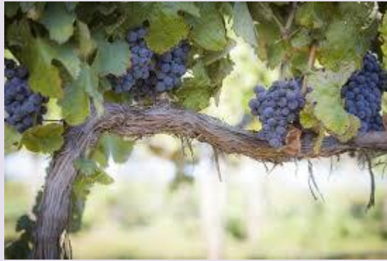
The Vine yields her strength

“Let the priests, the ministers of the Lord, weep between the porch and the altar, and let them say, Spare thy people, O Lord, and give not thine heritage to reproach, that the heathen should rule over them: wherefore should they say among the people, Where is their God? (v.17); Then will the Lord be jealous for his land, and pity his people. (v.18); Yea, the Lord will answer and say to His people, Behold, I will send you corn, and wine, and oil, and ye shall be satisfied therewith: and I will no more make you a reproach among the heathen: (v.19); But I will remove far off from you the northern army, and will drive him into a land barren and desolate, with his face toward the east sea, and his hinder part toward the utmost sea, and his stink shall come up, and his ill savour shall come up, because he has done great things. (v.20); Fear not, O land; be glad and rejoice: for the Lord will do great things. (v.21); Be not afraid, ye beasts of the field: for the pastures of the wilderness do spring, for the tree bears her fruit, the fig tree and the vine do yield their strength. (v.22); Be glad then, ye children of Zion, and rejoice in the Lord your God: for he has given you the former rain moderately, and he will cause to come down for you the rain, the former rain, and the latter rain as at first . (v.23); And the floors shall be full of wheat, and the vats shall overflow with wine and oil. (v.24)” (Joel 2)