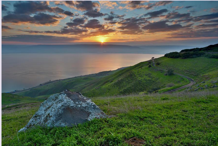
Sunrise over the Sea of Galilee

Isaiah said it best: “The people that walked in darkness have seen a Great Light: they that dwell in the land of the Shadow of Death, upon them a light has dawned.” (9 v 2)